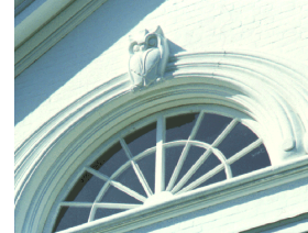
A keystone is central to a sound structure.

In the coming months we will be approaching area companies and organizations, encouraging them to help us in establishing a legacy of philanthropy for central Connecticut.