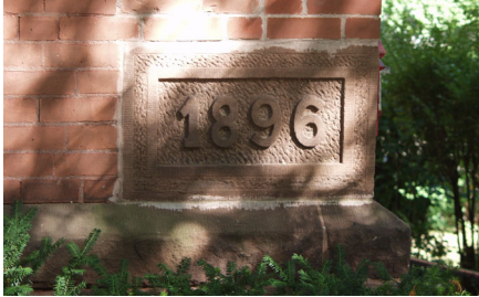
A cornerstone can anchor a foundation for centuries

The Foundation is pleased to announce the formation of our CornerStone Society to acknowledge those individuals who have either contributed to the Foundation or have signed letters of commitment to bequeath a gift through their will. Recently,